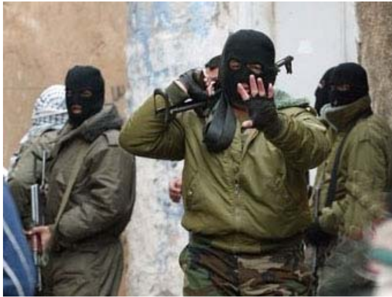
Masked Palestinian security forces during a raid in Balata refugee camp, West Bank. Yasser Arafat, who headed the PA from 1994 to 2004, allowed the existence of armed groups in the PA territories in order to use them against Israel. His successor, Mahmoud Abbas, has not changed this stark reality.

To make matters worth, Arafat’s encouragement of the growing militarization of the West Bank and Gaza backfired in grand style by enabling Hamas to eclipse the PLO as the dominant political and military