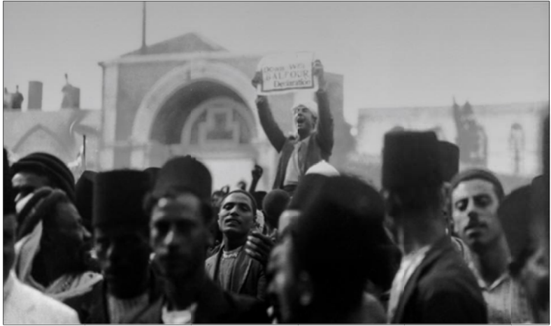
It took one full year for the first manifestation of local opposition to the Balfour Declaration to emerge in the form of a petition by a group of Palestinian Arab dignitaries and nationalists.

The Egyptian attitudes to the Balfour Declaration, ranging from indifference to endorsement, were largely mirrored in Palestine. Up to its conquest by the British, the country did not exist as a unified geographical or political entity but was divided between the Ottoman province of Beirut in the north and the district of Jerusalem in the south. Its local inhabitants, like the rest of the Arabic-