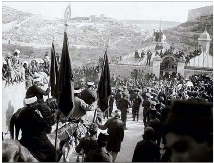
Palestinian Arab demonstrators, 1920. Faisal was crowned king of Syria in March 1920. The coronation was followed by riots in Palestine, which culminated in early April 1920 in a pogrom in Jerusalem in which five Jews were murdered and more than two hundred wounded.

Abdullah made his first overture to the Zionist movement in the autumn of 1921, indicating his readiness to recognize the Balfour Declaration and to allow Jewish settlement in Transjordan, which he had come to rule several months earlier, provided the Jews agreed to be incorporated into a unified kingdom under his headship. In the meantime, he had a small favor to ask. The £3,500 monthly subsidy from his father was paid through the Zionist-owned Anglo-Palestine Bank in Jerusalem. Would the bank be prepared to advance him £7,000 to be repaid by the remittance from his father? The bank’s evasive reply did little to deter the emir. In November 1922, he