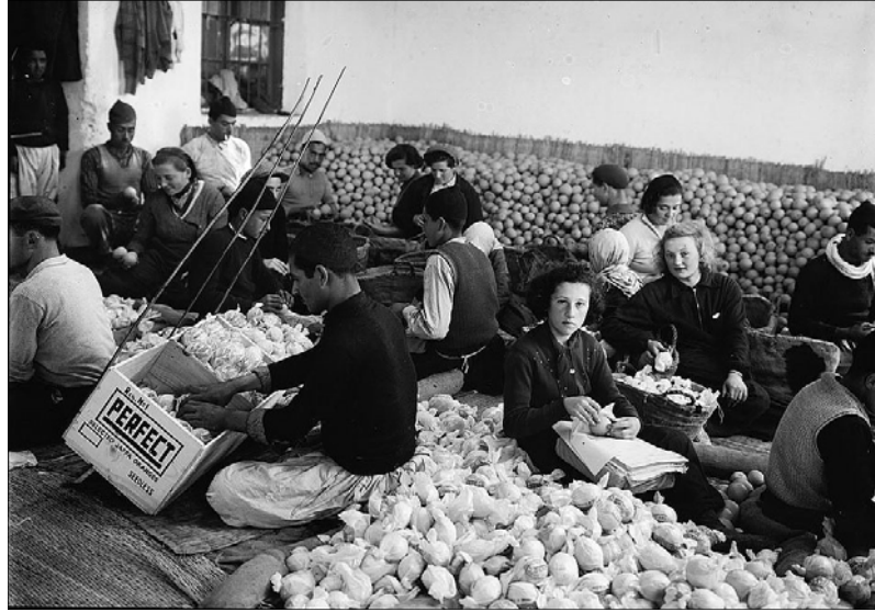
Jewish and Arab workers wrapping oranges in Rehovot. Throughout the mandate era, periods of peaceful coexistence were far longer than those of violent eruption, and the latter were the work of a small fraction of Palestinian Arabs.

while in purely Arab towns such as Nablus and Hebron it was only 7, and at Gaza there was a decrease of 2 percent. 27