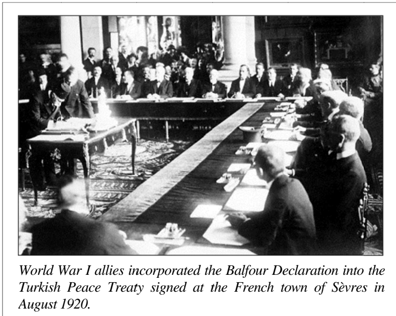
World War I allies incorporated the Balfour Declaration into the Turkish Peace Treaty signed at the French town of Sèvres in August 1920.

It is an emotionally gripping claim, but it is also the inverse of truth. For one thing, Britain did consult its main war allies, notably U.S. president Woodrow Wilson, before issuing the declaration, which was quickly endorsed by the contemporary international community, including the leaders of the nascent pan-