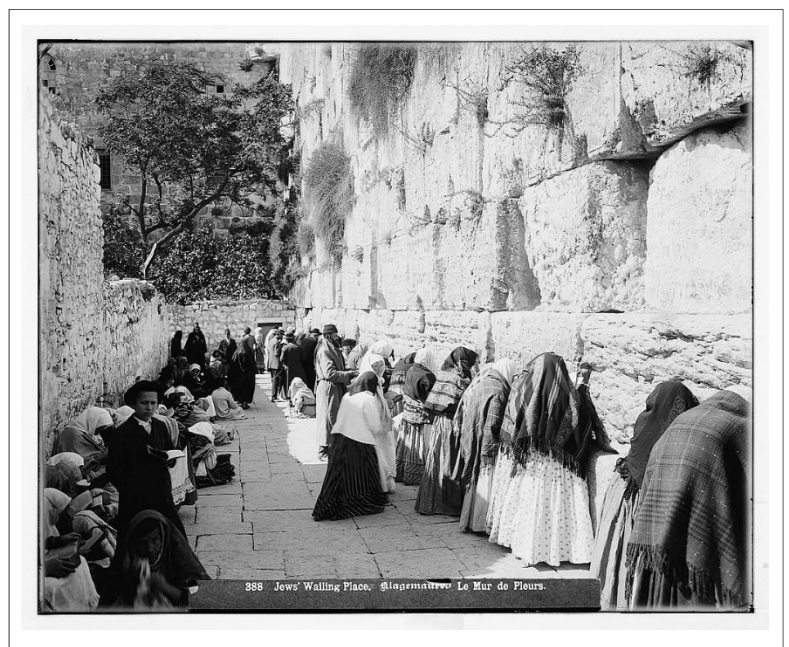
The sacredness of the Western Wall is a relatively recent phenomenon and an outgrowth of Sultan Suleiman I's (r.1520-66) rebuilding activities in Jerusalem. The site was originally just a narrow alley (above) that restricted its usage by the city's Jewish worshippers.