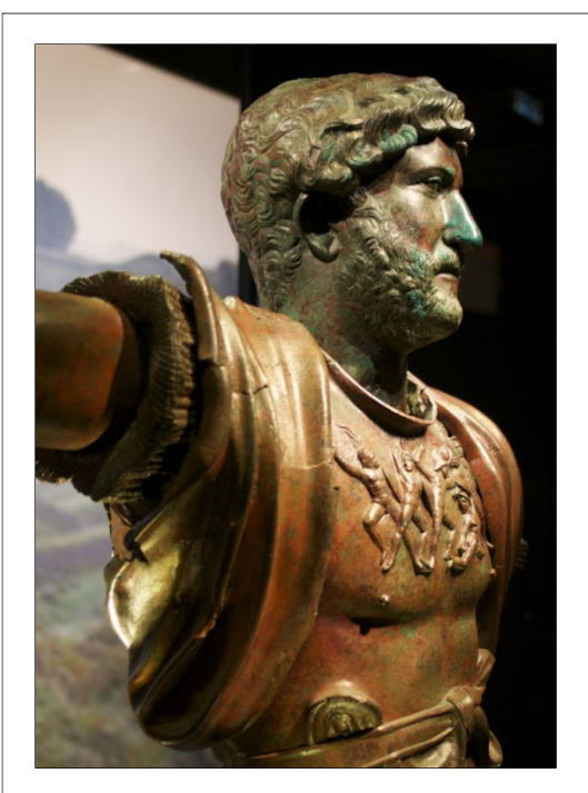
Roman emperor Hadrian put down a bloody Jewish insurrection in Judea, circa 132–36 C.E. The emperor punished the Jews by barring them from the Temple Mount for their prayers. Yet there is no indication that they prayed at the Western Wall of today.

widening schism between Israel's Orthodox religious establishment and the Diaspora Conservative and Reform movements over this holy site?