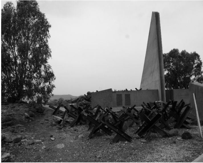
The remains of a Syrian fortification on the Golan Heights following the Six-Day War. Nasser realized that no Israeli attack on Syria was in the offing yet continued his reckless escalation toward war.