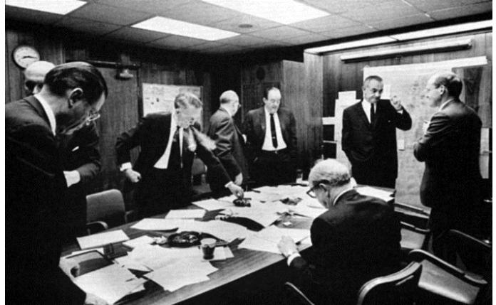
U.S. president Lyndon B. Johnson (2 nd from right) in the White House Situation Room during the Six-Day War. The administration was far from resolute in its support of Israel. It considered a scenario involving military action against the Jewish state.

Israelis were in some ways culpable for the events that led to war: