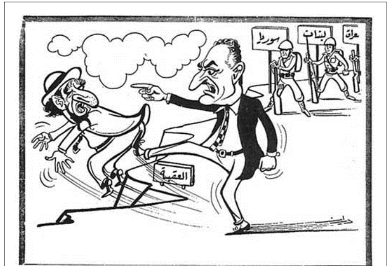
A cartoon from 1967 shows Nasser kicking Israel over a cliff. Jerusalem's attempt before the Six-Day War to prevent hostilities is completely ignored or dismissed while the Arab war preparations are framed as a show of force against an alleged, imminent Israeli attack on Syria.

It is a general law that every war is fought twice—first on the battlefield, then in the historiographical arena—and so it has been with the June 1967 Arab-Israeli war (or the Six-Day War as it is commonly known). No sooner had the dust settled on the battlefield than the Arabs and their Western partisans began rewriting the conflict's narrative with aggressors turned into hapless victims and defenders turned into aggressors. Jerusalem's weeks-long attempt to prevent the outbreak of hostilities in the face of a rapidly tightening Arab noose is completely ignored or dismissed as a disingenuous ploy; by contrast, the extensive Arab war preparations with the explicit aim of destroying the Jewish state is whitewashed as