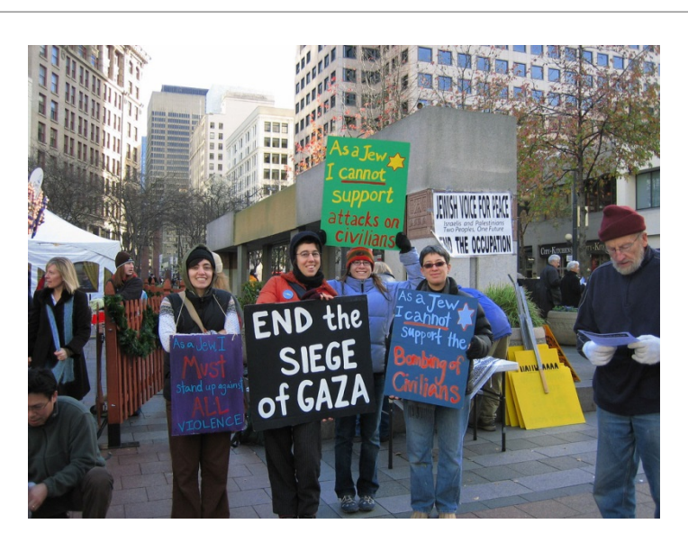
Questions about highly charged current issues should be omitted because Islamist views overlap with non-Islamist outlooks. For instance, Islamists are hardly the only ones who condemn Israel. Here Jewish Voice for Peace activists protest against Israeli policies.