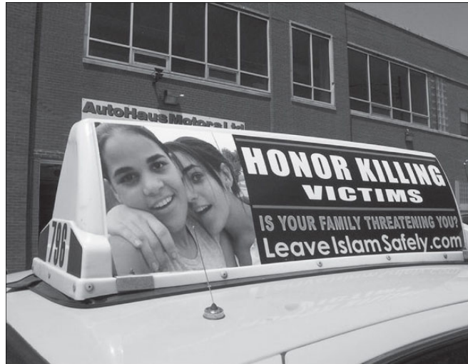
Sex remains a focus of criticism of Muslims, concerning such topics as female genital mutilation, child marriage, polyandry, and honor killing.

Thus, old prejudices remained intact. William Gladstone , a British prime minister, described Turks in his sensational 1876 tract, Bulgarian Horrors and the Question of the East , as “the one great anti-human specimen of humanity. Wherever they went, a broad line of blood marked the track behind them; and as far as their dominion reached, civilization disappeared from view.” 34 A future prime minister,