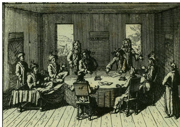
In the year 1699, the Ottoman Empire signed the highly disadvantageous Treaty of Carlowitz with the Holy League. After more than a millennium of threatening Europe, Muslims now had to defend themselves from the military superiority of Europe.

The following account looks first at several kinds of changes and then at several kinds of continuities. The main changes are three-fold: European strength of arms, lessened religious sentiments, and a Left seeking allies.