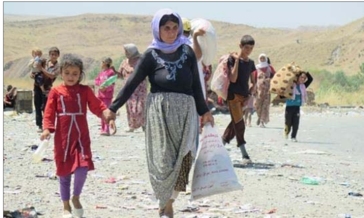
Executing prisoners by beheading and sexual assaults on women are common Islamic State tactics. In Iraq, Yazidi women and girls, many aged 14 and younger, have been forcibly married, sold, or given to Islamic State fighters and supporters. ISIS behavior upends the "laws of war" agreed upon by most nations beginning in the 19th century.

Facing such a foe requires readdressing the perennial legal issues posed by warfare with totalitarian states that are utterly contemptuous of the laws of armed conflict and proud of that contempt. If the jihadist state wages war as a total war, with no distinction between military and civilians, will it be possible for the West not to wage one as well? When fighting jihadists, should clerics be automatically defined as noncombatants and religious sites as non-targetable even though both may well be regularly and directly involved in combat operations? If a madrassa (Islamic school) provides military training to its students, or a mosque is used as a weapon depot or as a base for an ISIS unit, does that make them legitimate targets? Should one even consider taking prisoners if those surrendering may actually only want to get close enough to kill the people trying to capture them? Can ISIS's wounded be treated if those wounded try to kill the medical personnel treating them? Clearly, Western powers contemplating taking on such an enemy need to examine the international law and war crimes issue before engaging in combat, lest their enemies use "lawfare" against them in spite of the undisguised criminality of ISIS. 45