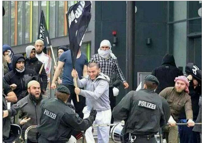
ISIS supporters attack police in Germany. Western societies must take seriously an ideology whose adherents embrace mass murder, genocide, and slavery because they believe those practices have been ordained by God. This enemy is not going to just go away even if Washington or the West eventually destroys the Islamic State.

Those contemplating destroying ISIS need to understand an organization, movement, and people whose thinking is profoundly alien to that of the West. The Western nations will need to update their understanding of totalitarianism and fascism and move it beyond twentieth-century secular ideologies because what is at issue here is deeply intertwined with religion. The West must become reacquainted with the depths of human malevolence and the power of malignant idealism and organized hate. Western societies must take seriously an ideology whose adherents embrace mass murder, genocide, and slavery because they believe those practices have been ordained by God. The West also needs to understand individuals and whole societies where religious fanaticism is central to their psychology. Above all, the West needs to understand that the jihadists and their ideology are not at the lunatic fringe of Islam but are instead the fanatic core of Islam with deep and enduring roots in the faith's history and thinking, especially in the Wahhabi interpretation of Islam. 46 The bottom line is that this enemy is