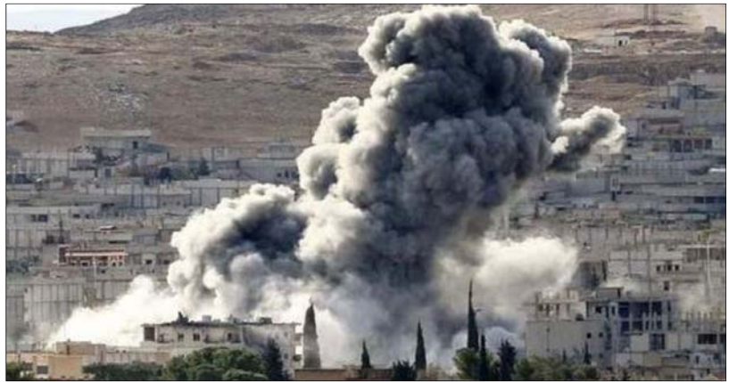
An air campaign by Western powers will only contain ISIS, not destroy it, because the group's strategic centers of gravity may be largely invulnerable to air attack. Air strikes also increase the likelihood of civilian deaths.

The ground war will need to be slow and methodical. Western forces should not expect a "race to Baghdad," an air-to-ground