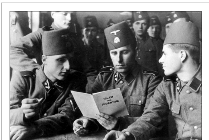
Many books about the Waffen-SS division in Bosnia display photographs of its soldiers reading a booklet titled Islam und Judentum —most certainly the German version of the mufti’s Croatian or Bosnian pamphlet Islam i židovstvo (Islam and Judaism). The booklet offers a stark illustration of the lengths taken by the mufti to demonize Jews and Judaism and clearly was produced for propaganda and incitement purposes.

Now, the Jews were persuaded that Muhammad was immune to their attacks. Therefore, they made a decision to spread discord among the Arab tribes, so as to break the power of Islam. When Muhammad went back to Medina, he succeeded in reconciling the Arab tribes of Kawsha and Karasha, 10 which had been fighting each other ceaselessly for 120 years. In doing so, he significantly strengthened Islam’s position. Members of those two [formerly] hostile tribes became brethren in Islam, and peace