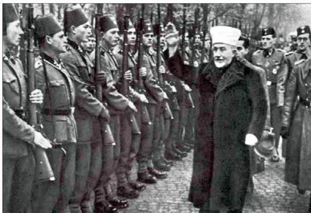
The mufti of Jerusalem, Muhammad Hajj Amin Husseini, visits the volunteer Nazi Waffen-SS division in Bosnia, made up mostly of Bosnian Muslims. The mufti was instrumental in the division’s formation.

Muhammad’s influence, in both the spiritual and business spheres, could turn into a danger for them. Thus they were possessed by a deep hatred toward Islam; hatred that intensified as Islam was growing more solid and powerful. The Jews breached the agreement they had concluded with Muhammad in Khaibar, of which we shall speak later. Moreover, their rage grew immensely when the Qur’an revealed the deepest inclinations of their soul, their heartlessness, and unscrupulousness by which their ancestors had been commonly known. At that time, the Jewish methods were already the same as they are today. Their weapon has been, as always, slander and quarrel, and so they attempted to humiliate Muhammad in the eyes of his followers. They claimed that he was a deceiver, an enchanter, and a liar. When they did not succeed in this, they attempted to undermine Muhammad’s honor by spreading a rumor that his wife Aisha committed adultery. The purpose of spreading such a rumor was to sow doubt in the hearts of Muhammad’s followers.