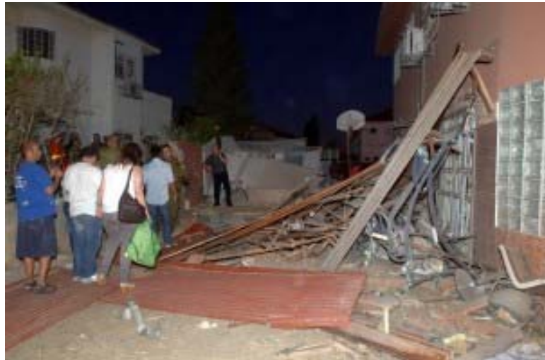
A house is destroyed by a Hamas rocket in Beersheba, July 2014. In the preceding year-and-a-half, Hamas fired some 200 rockets and mortar shells from Gaza while in the three weeks attending the abduction of three Israeli youths in June 2014, they fired another 232.

O n July 8, 2014, in response to a barrage of rockets and missiles on its population centers from the Gaza Strip, Israel launched heavy air and artillery strikes against the Islamist terror group Hamas that had ruled the area since 2007. As these failed to stop the attacks, on July 17, the Israel Defense Forces (IDF) invaded the Strip in strength. After three weeks of heavy fighting, the IDF withdrew to the international border and sustained the air campaign until a cease-fire came into effect on August 26.