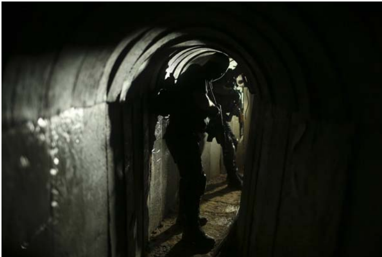
A Hamas terrorist crouches in a tunnel. The IDF learned important lessons on how to detect and destroy tunnels during the 2014 operation. Much of what was done was improvised and will now become institutionalized.

2006 Lebanon war, a number of units suffered from a lack of tactical intelligence; in Gaza, commanders at times complained that they were flooded with too much information, partly the result of integration of novel communication and information systems. The IDF is now seeking the correct balance. Other important areas of study are media management and the issue of lawfare (pursuit of strategic aims through aggressive legal maneuvers). One lesson has already been implemented: The IDF now employs teams of senior reserve officers to investigate specific incidents or areas of concern and swiftly submit reports for IDF command to respond or change a certain course of action such as the use of artillery fire in populated areas. 16