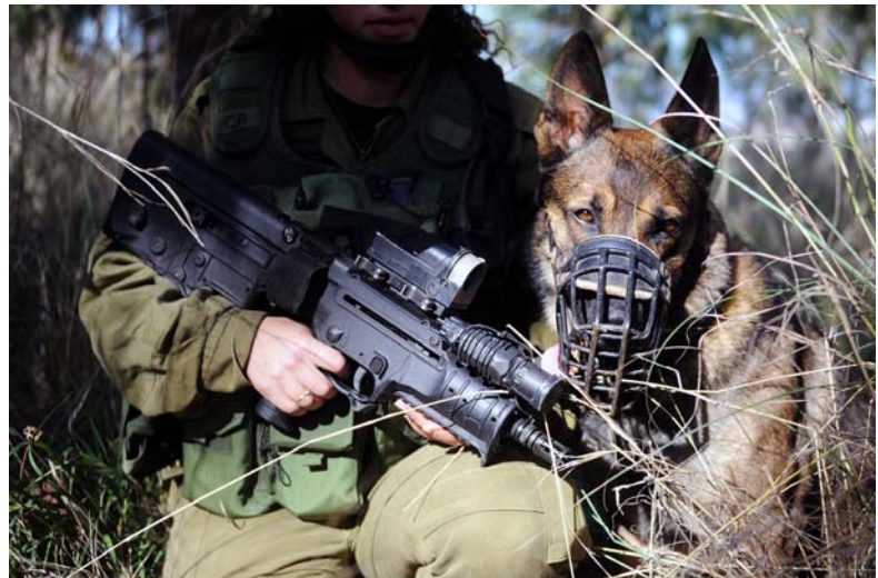
Hamas defenses included improvised explosive devices, booby traps, mines, snipers, and mortar and anti-tank missile squads. Some of the lessons from previous operations in urban areas in the West Bank, Gaza, and Lebanon were implemented, such as the use of dogs (pictured above,) bomb demolition squads, and elite infantry units to clear the way.

But matters must be kept in proportion. The IDF outnumbered Hamas 3:1 and enjoyed close fire and intelligence support. The challenge was, therefore, not whether it accomplished its mission, but rather when and at what cost in human life. Another challenge that weighed on commanders’ minds was the threat of a kidnapped soldier with a repeat of the Corp. Gilad Shalit affair. Indeed, Hamas spared no effort plotting such an outcome. In the heat of battle, it was able to snatch the remains of two Israeli soldiers but failed in attempts to capture a live soldier.