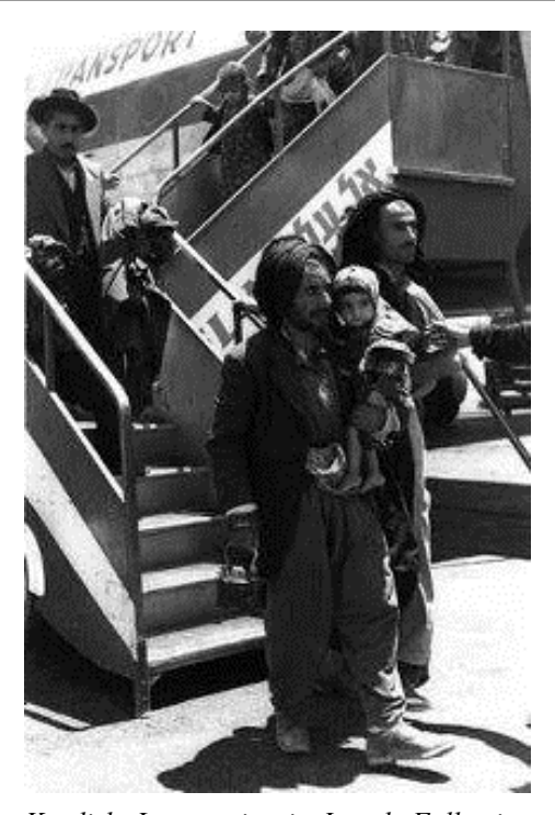
Kurdish Jews arrive in Israel. Following the establishment of the state of Israel, Kurdish feelings toward the Jews were transformed into a certain admiration and the urge to imitate Jewish success in the new state. Relations were characterized by mutual trust that became an important asset for ties in modern times. In turn, Kurdish Jews who migrated to Israel in the 1940s and early 1950s became excellent ambassadors for the Kurds of Iraq, publicizing and pleading their cause among the Israeli public.

n 1966, Iraqi defense minister Abd al-Aziz al-Ugayli blamed the Kurds of Iraq for seeking to establish "a second Israel" in the Middle East. He also claimed that "the West and the East are supporting the rebels to create [khalq] a new Israeli state in the north of the homeland as they had done in 1948 when they created Israel. It is as if history is repeating itself." An Arab commentator had warned earlier that if such a thing should happen, "the Arabs will face within two decades their second nakba [catastrophe] after Palestine."<sup>2</sup> These contentions speak volumes regarding Iraq's threat perceptions of the Kurds more than four decades after the establishment of the Iraqi state. They also conceptualize Israel as the ultimate evil in the region. Such accusations are echoed today by some Arab media, which claim that Kurdistan is following in the footsteps of "Yahudistan" ("Land of the Jews").3 Seen from the Kurdish and Israeli perspectives, these linkages and parallels are intended to demonize and both while delegitimize also implying illegitimate relations between them. The intriguing questions are therefore what kind of relations exist between Israel and the Kurds?