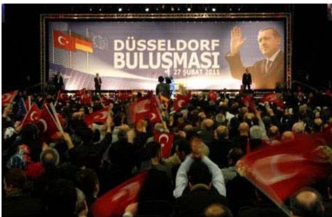
Changing demographics will affect the number and type of military recruits available in European countries. In Germany, for example, some authorities look to Germany’s Turkish immigrant population as a new source of recruits while others wonder about the effects. The warm welcome German-based Turks gave Ankara’s Islamist prime minister Recep Tayyip Erdoğan during his March 2011 visit prompted some concern when Erdoğan called for immigrants not to assimilate into German society. He urged immigrant children to learn Turkish first, then German.

forces].” 8 The problem became even more complicated after Germany discontinued the draft in 2011. While some authorities look to Germany’s Turkish immigrant population as a new source of recruits, 9 others wonder how this will work in practice. For example, the warm welcome German-based Turks gave Ankara’s Islamist prime minister Recep Tayyip Erdoğan during his 2011 visit may be cause for concern if their leadership endorses his call not to assimilate into German society. 10 The call by Bekir Alboga, a German-Turkish leader, at the 2013 annual German Islamic Conference (Deutsche Islamkonferenz) for equal treatment of Islam, more university faculties of Islamic theology, and wider acceptance of head scarves,