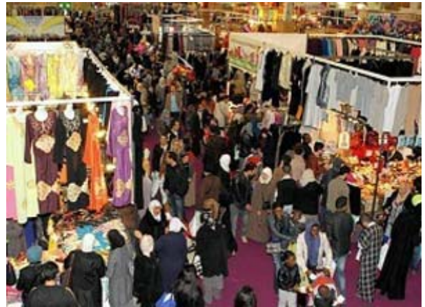
The first Muslim fair in Brussels in 2012 (above) had more than 20,000 visitors. In Brussels, an estimated 22 percent of residents are Muslims, and the Muslim quarter is only a few underground stops away from the European Union headquarters. In London, Muslims dominate the borough of Tower Hamlets; in Paris, Clichy-sous-Bois; in Berlin, the Kreuzberg neighborhood. In both Malmö, Sweden, in the north and Marseilles in the south, Muslims account for an estimated quarter of the population.

While today’s overall percentage of European Muslims seems relatively small, their impact is greater than one would expect as they are clustered in certain urban areas and in countries of strategic importance. Western Europe, where the growth in