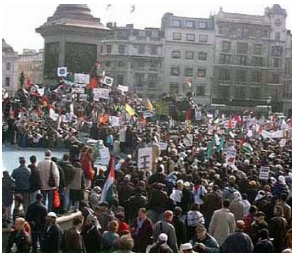
The Muslim Association of Britain, linked to the Muslim Brotherhood, turned out an estimated crowd of 100,000 in April 2002 in London to protest the Israeli foray into Jenin. Such groups as the MAB are capable of enhancing the Islamist influence and political power in Europe.

Indeed, according to press reports, the streets of some European cities are increasingly controlled by Islamic gangs. 37 The gangs themselves may simply be engaging in criminal activity and use no-go zones as a convenient refuge or base of operations. Their connection to Islam may be purely pragmatic. As one British gang member put it, “The reality is that Asian gangs don’t give much of a toss about religion, but with Islam comes fear, and with fear comes power.” 38 But such power ought to belong to the state and its representatives alone. A breakdown in authority of this fashion bodes no good for European society as a whole.