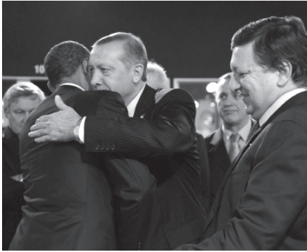
President Obama (left) and Prime Minister Erdoğan greet each other at a summit in Cannes, November 3, 2011, signaling a thawing of relations between the two nations, especially in response to the Syrian regime's bloody repression of its citizens.