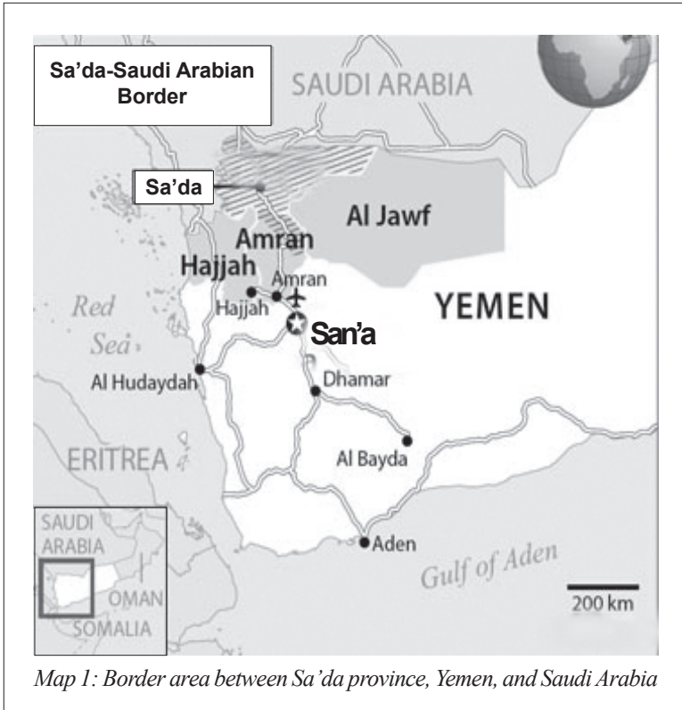
Map 1: Border area between Sa'da province, Yemen, and Saudi Arabia

cluded Hussein's brother Muhammad, the BYC aimed at providing education to the youth of Sa'da while reviving the influence of Zaidia, a Shiite branch endemic to Yemen, which had been in decline since the overthrow of the imamate. 3