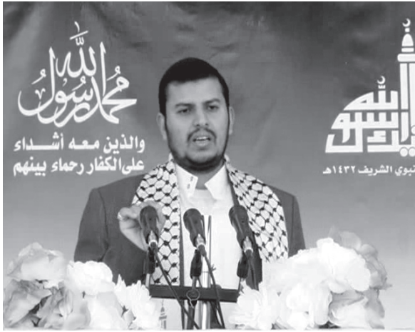
Abd al-Malik, pictured, has taken up the mantle of the rebellion's leadership. He is the brother of the movement's founder, Hussein al-Huthi, and son of Badr ad-Din al-Huthi, an elderly and highly influential Zaidi scholar considered to be the principal religious authority for the rebel group.

geographical, and cultural particularities, the province exhibits a great deal of internal diversity. It can be divided into three main regions: the tall mountains and adjacent foothills in the west, the arid mountains and highlands in the center, and the desert to the east. While the sparsely populated eastern desert is mostly inhabited by tribes belonging to the Bakil, one of Yemen's two main tribal confederations, the western mountains are the main population center for the tribes of Khawlan bin Amr, Yemen's third and least politically influential tribal confederation. Some tribes of the Hashid confederation, whose members have largely dominated Yemen's post-imamate government, live in the Sa'da highlands alongside Bakil and Khawlan tribes although Hashid's prominence is greater in areas south of Sa'da.