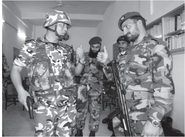
A Chinese special forces commander gestures to a Pakistani soldier during a joint military drill near Karachi, Pakistan, March 8, 2009. The growing alliance between the People’s Republic of China and Pakistan further complicates U.S. policy options and exacerbates tensions in the area. Some 11,000 Chinese troops have been stationed in Pakistan’s northernmost province, and Beijing has promised Islamabad advanced fighter jets.

If the present flawed strategy is sustained, it is likely that the Obama administration, having eventually realized Afghanistan’s increasing destabilization, will not uphold the withdrawal timetable that began in July and will instead commit troops for many years to come. Indeed, senior military figures such as Adm. Michael Mullen, chairman of the Joint Chiefs of Staff, already have in mind a much greater, long-term commitment to a large U.S. military presence. 35 Though a