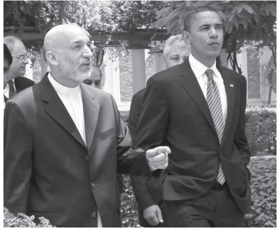
Current U.S. strategy in Afghanistan is heavily reliant on the whims and schemes of President Hamid Karzai (left), a feckless and inconsistent U.S. ally, seen here with then-presidential candidate Barack Obama, Kabul, July 21, 2008. The 2009 Afghan presidential elections were marked by low voter turnout, ballot stuffing, intimidation of opponents, and widespread electoral fraud.

Other flaws of the Karzai regime include its disregard for the concepts of freedom and human rights and the presence of drug lords and war criminals in its ranks. As Freedom House’s 2010 Afghanistan assessment noted, while “blasphemy and apostasy by Muslims are considered capital crimes,” the Afghan supreme court is “composed of religious scholars who have little knowledge of civil jurisprudence.” Furthermore, prison conditions are extremely poor with many detainees held illegally and “in a prevailing climate of impunity, government ministers as well as warlords in some provinces sanction widespread abuses by the police, military, and intelligence