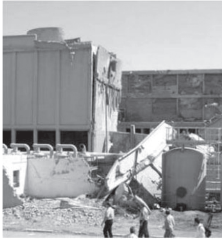
The ruins of Iraq's Osirak reactor, destroyed by an Israeli air-raid in 1981, are visible reminders that led Iran's mullahs to develop a secretive, well-shielded, and diffused nuclear program in an attempt to avoid a repeat of Saddam Hussein's mistakes.

would still shift the balance of power greatly. Iran projects its power throughout the Middle East mainly by way of allies and proxies, such as Muqtada al-Sadr's Mahdi army in Iraq, Hamas in Gaza, the Assad regime in Syria, and Hezbollah in Lebanon. The Iranian nuclear umbrella will embolden them. The next time an Israeli soldier is abducted in a cross-border attack by Hezbollah or Hamas, Jerusalem will have to weigh the risks of a nuclear escalation before responding. There is also the possibility that Tehran could provide a nuclear device to one of its terrorist proxies. 17