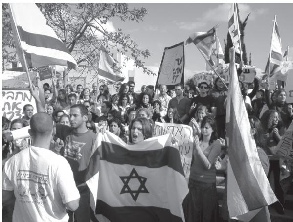
Not all Israeli students accept the anti-Zionist narratives of their professors. Here members of the student organization Im Tirztu rally in support of the Jewish state. The group is under assault by academics for the crime of cataloguing information about academic political bias, gleaned from course descriptions and syllabi.