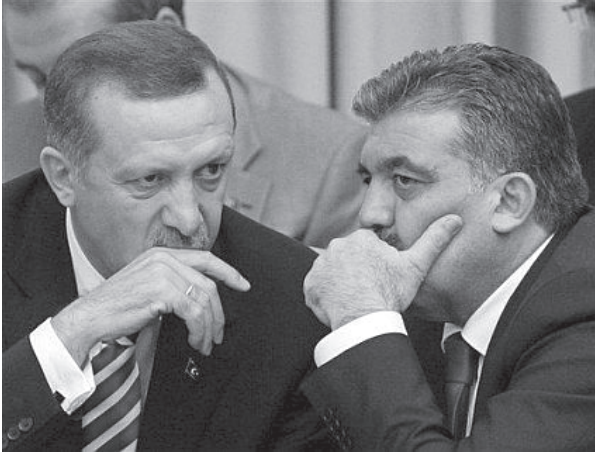
U.S.-Turkish relations following 9/11 suffered, especially after the Turkish parliament, dominated by the Justice and Development Party's Recep Erdoğan (left) and Abdullah Gül (right), refused to permit the transit of the U.S. 4 th Infantry Division to Iraq.

an F-117 stealth fighter 25 and a small number of other fixed and rotary wing aircraft). U.S. and allied forces essentially bombed Serbia into submission, and NATO ground troops, including U.S. units, assumed a peacekeeping mission within three months of the start of the bombing campaign. There was, therefore, nothing in Washington's Balkan operation that called into question what had become its way of war: heavy reliance on expensive high technology weapons; land forces that emphasized speed and maneuver; and operational plans that forecast an enemy arrayed against a forward edge of battle that would have to be broken through or encircled. The wars in Afghanistan and Iraq changed all that.