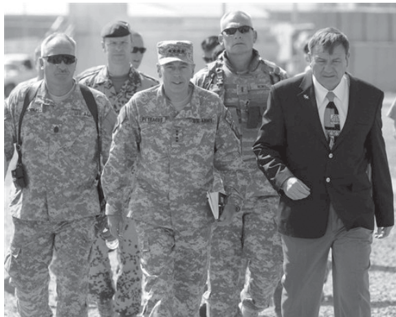
Under Gen. David Petraeus (middle, with U.S. ambassador to Afghanistan Karl Eikenberry, right), U.S. operations expanded from counterterrorism measures designed to “disrupt, dismantle, and defeat al-Qaeda in Pakistan and Afghanistan and to prevent their return to either country” to a counterinsurgency strategy viewing nation-building and democratization as essential to military success.

Additional evidence to support the claim that Pakistan is at least somewhat favorable to the Taliban and would be more so should U.S. forces withdraw, can be seen in the accusations