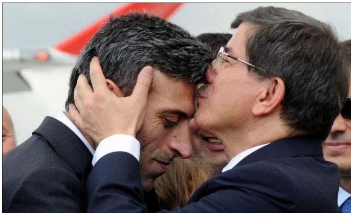
In June 2014, ISIS captured Mosul, Iraq, and raided the Turkish consulate compound, taking forty-six personnel hostage, including the consul-general. Here, Turkish foreign minister Ahmet Davutoğlu (right) kisses Turkish consul-general Oztürk Yılmaz on his return to Turkish soil after the hostages were freed. Davutoğlu claimed the release was the work of the country's intelligence agency although it is thought that cash switched hands.

Following months of Western media accusations over Turkey’s quiet support for ISIS, the Turkish leadership, in early 2015, decided to launch its own public diplomacy offensive. In January, the government announced that—for the first time—it had arrested a Turkish national on charges of joining ISIS. About a month later, on February 11, the Turkish General Staff announced that security forces had arrested