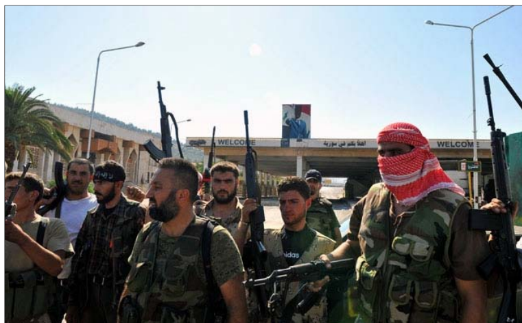
Syrian rebels pose after seizing control of the Bab al-Hawa crossing on Turkey’s border, July 20, 2012. In February 2015, Ankara and Washington signed an agreement stipulating the initial training of some 2,000 Free Syrian Army fighters by a Turkish-U.S. team at a military base in Turkey, with an expansion of the program possible. However, the two countries remained divided over whether the priority target in Syria is Assad or ISIS.

For months, the Western allies have pressured Turkey to close its porous border, which has allowed thousands of jihadists to cross into Syria to join the Islamic State ... and has enabled ISIS to smuggle in weapons and