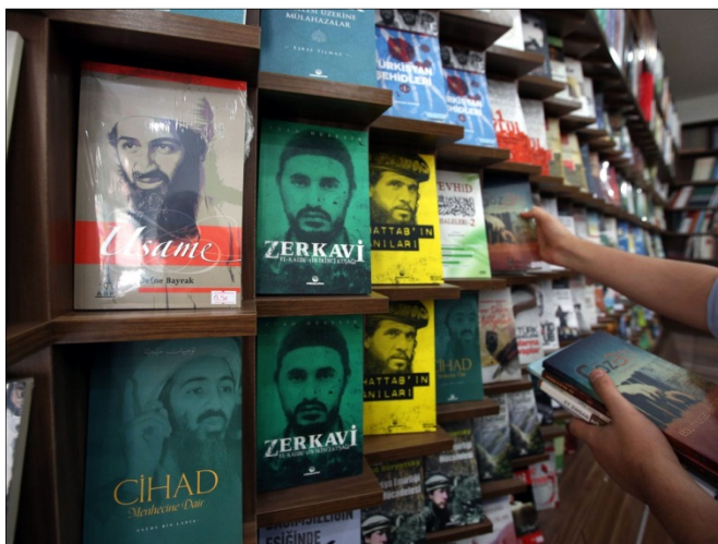
Books about Osama bin Laden and other Islamists are displayed at an Islamic bookstore in the Fatih district of Istanbul, October 13, 2014. In August 2014, the Turkish polling service MetroPOLL found that "11.3 percent of Turks did not view ISIS as a terrorist organization." Such findings raise fears that Turkish sympathizers might be willing to fight with ISIS in Iraq and Syria or even inside Turkey if Ankara were seen as allied with the West against their Salafist comrades.

President Erdoğan's euphemism for ISIS is another indication of his semi-hidden sympathy for the jihadist cause. In October 2014, after a meeting in Paris with French president Francois Hollande, he criticized those "who try to portray ISIS as an Islamic organization. ... I am deliberately avoiding the use of the acronym ISIS," he told his audience. "I use the name 'Daesh' because these are terrorists." 10 Shortly afterward, key Turkish government agencies including the military general staff and foreign ministry happily endorsed the new acronym. 11