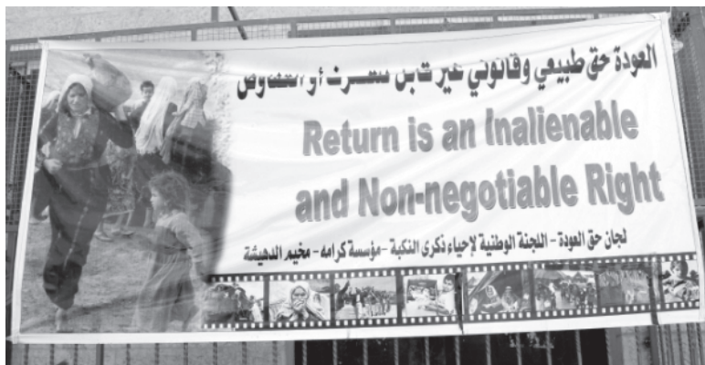
Rather than focus on its original mandate of resettlement, UNRWA has become a politicized advocate for the Palestine cause of repatriation as seen in this sign from the UNRWA-established Dheisheh refugee camp in the West Bank.

The right of return has been largely sustained by Palestinian and Western intellectuals since the late 1970s. 60 During the Oslo accords process, the PLO initially sought to deemphasize the concept as a means of strengthening its international standing, but it was dramatically reemphasized after 2000. 61 This coincided with the deliberate shift within UNRWA from top-down management to strategies of refugee consultation, participation, and political empowerment. 62 During this period, UNRWA also facilitated grassroots refugee committees, in opposition to the PLO, which pursued complete repatriation in place of a negoti-