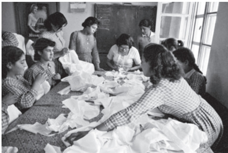
As the need for housing and rations subsided, the agency reoriented its mission to providing education and vocational skills as in this UNRWA sewing center in Amman, Jordan. Increasing access to education and raising educational levels are inherently unobjectionable, a fact that UNRWA has traded on since the 1950s.

Kuwait, also resulted in Palestinian marginalization and mass expulsion. Educated Palestinians returning to the West Bank and Gaza relied yet again on UNRWA's relief services. 18 During and after the years following the Oslo accords, UNRWA and UNRWA-educated Palestinians took the lead in opposing the PLO's negotiations with Israel under the aegis of the "rights-based approach" and preserving the right of return.