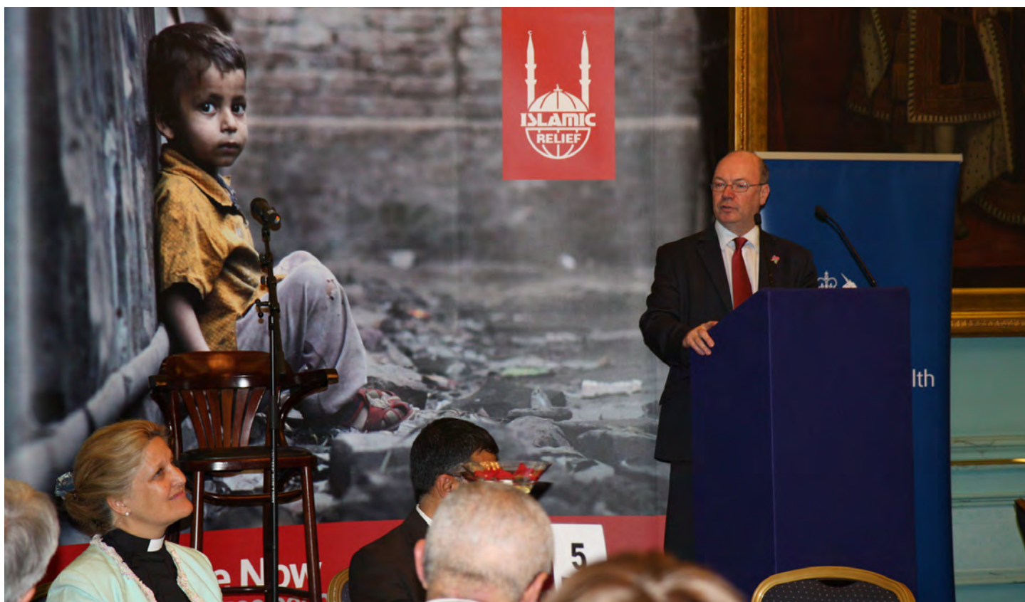
Former British Foreign Office Minister Alistair Burt speaks at Islamic Relief event in 2012