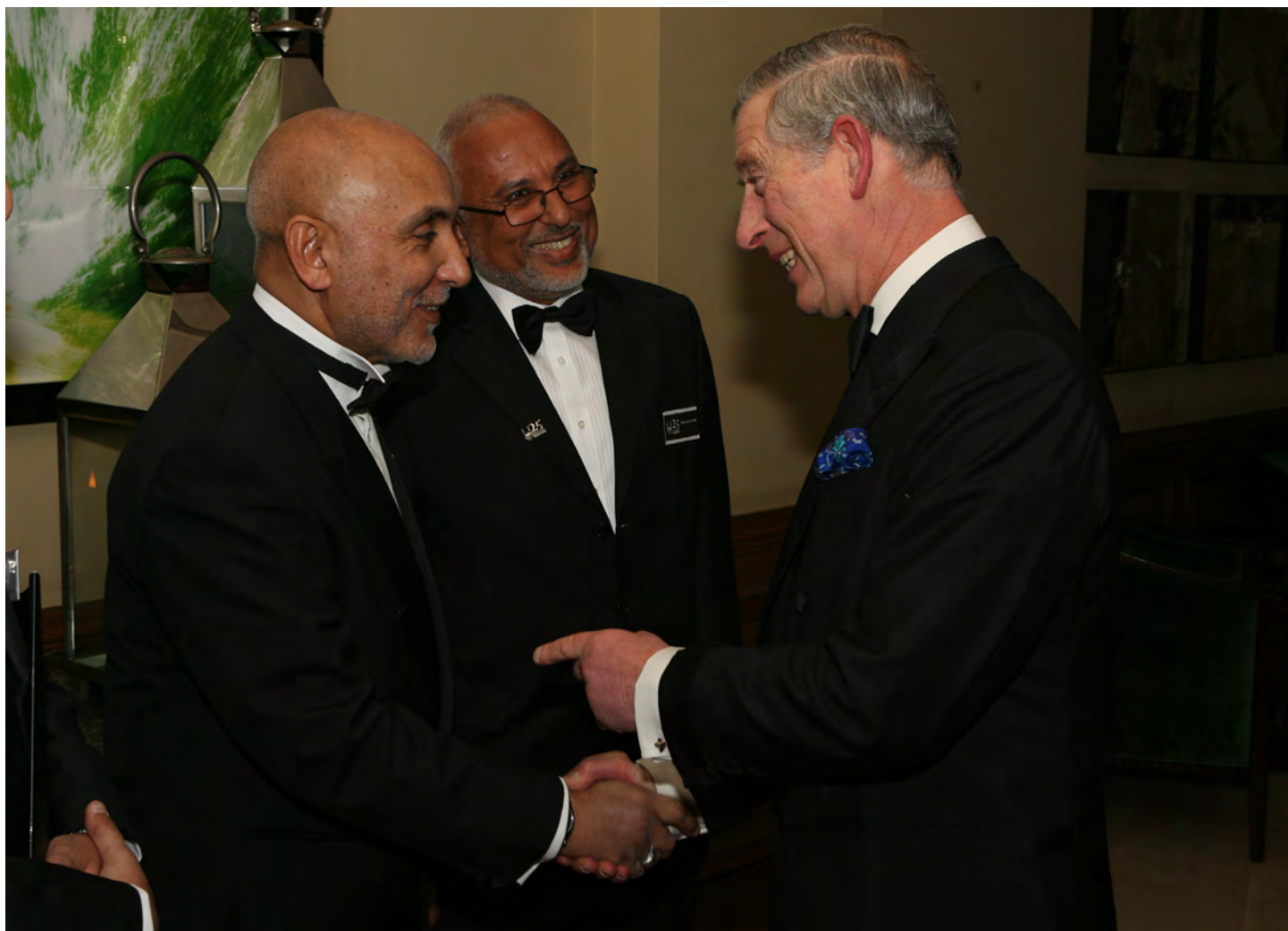
Islamic Relief founder Hany El-Banna meets Prince Charles

It is tempting to distrust the claims of prosecutors and journalists in Sisi's Egypt, where the regime is not much less illiberal than the Muslim Brotherhood government it replaced. But as this dossier will show, Islamic Relief is a flagship institution of global Islamism. It was established by the Muslim Brotherhood and today it remains a key part of the Brotherhood's international infrastructure. This connection can be mostly clearly seen by examining the Islamist operatives that established Islamic Relief, and continue to manage the charity and its many branches today.