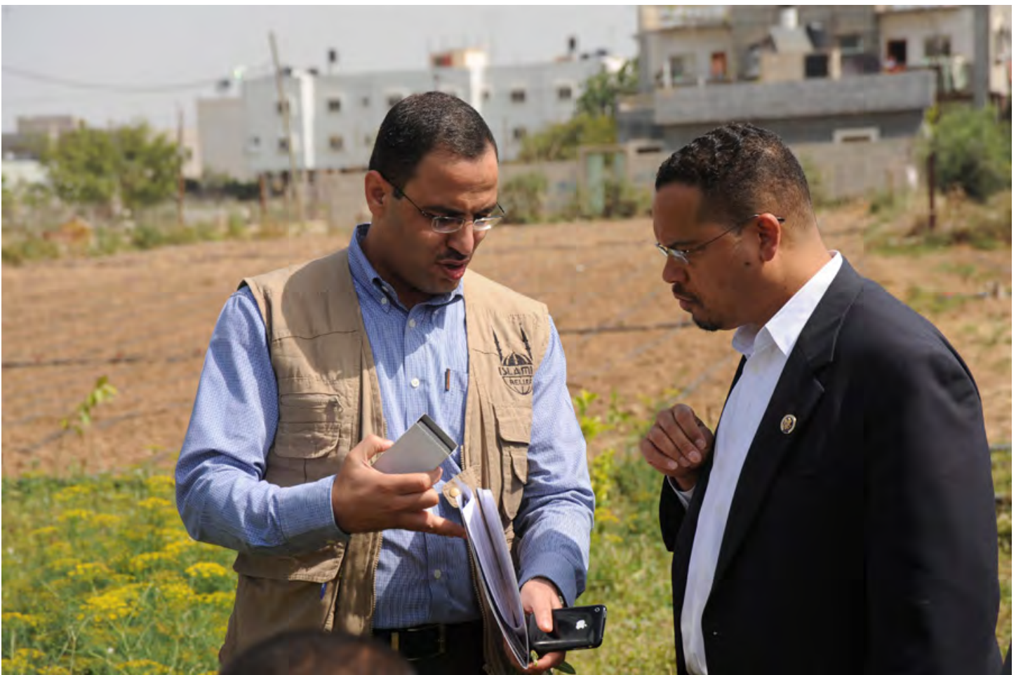
Islamic Relief takes Congressman Keith Ellison to Gaza

With which organizations, then, is the Islamic Relief franchise financially involved?