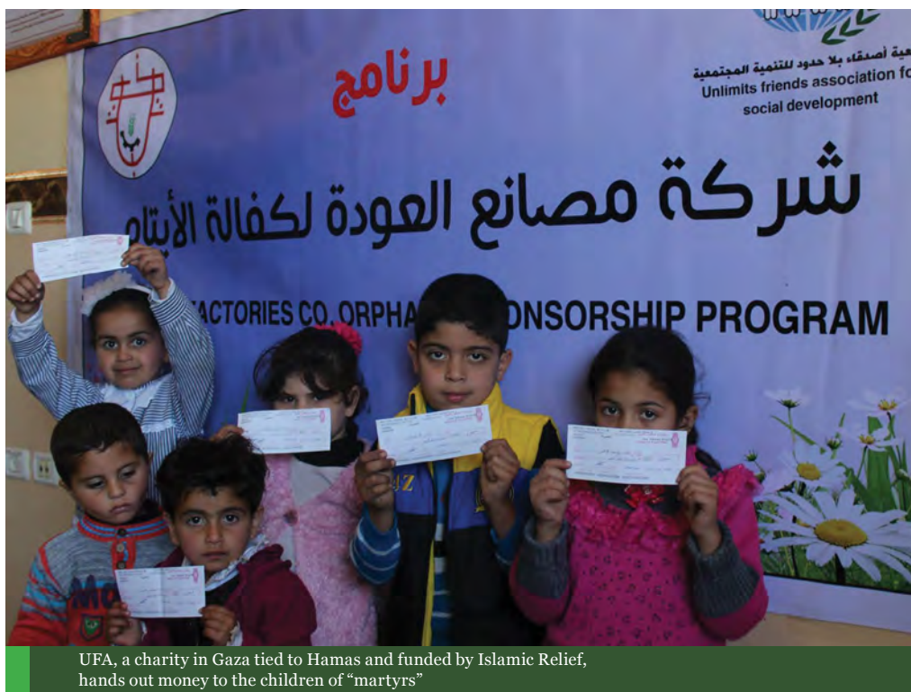
UFA, a charity in Gaza tied to Hamas and funded by Islamic Relief, hands out money to the children of "martyrs"

UFA openly advertises projects funded by U.S. charities in prominent Hamas literature. 226 And the UFA website boasts a certificate of support from Ummah University, an institution in Gaza directly controlled by Hamas's interior ministry. 227