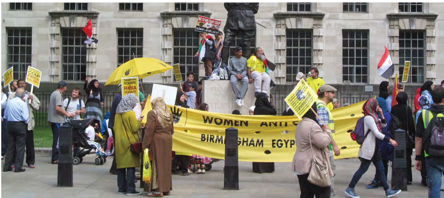
Muslim Brotherhood supporters from Birmingham in the UK