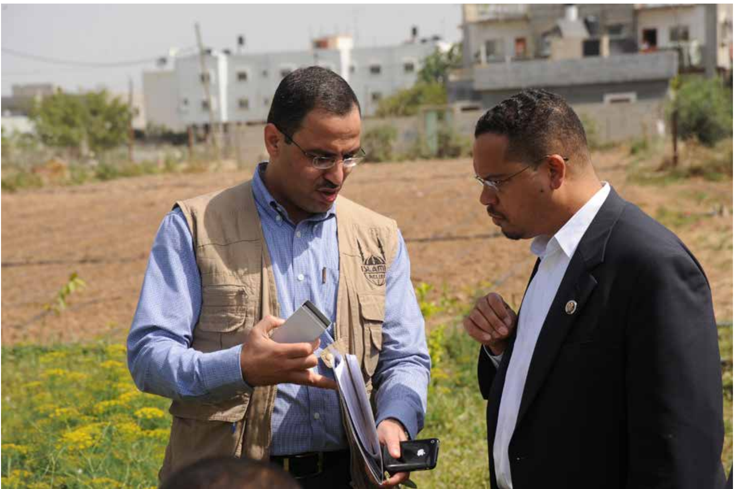
Islamic Relief takes Congressman Keith Ellison to Gaza

With which organizations, then, is the Islamic Relief franchise financially involved?