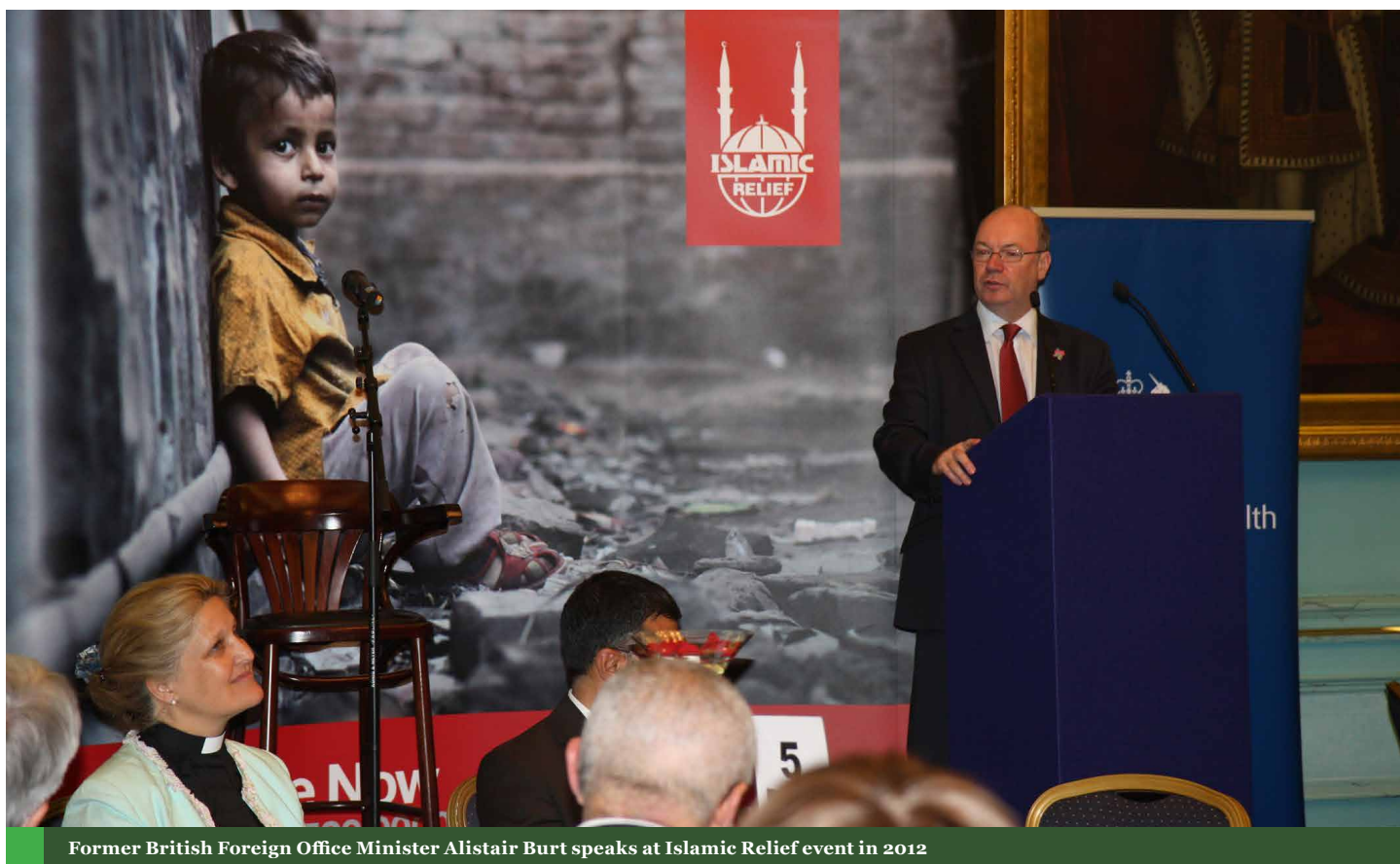
Former British Foreign Office Minister Alistair Burt speaks at Islamic Relief event in 2012