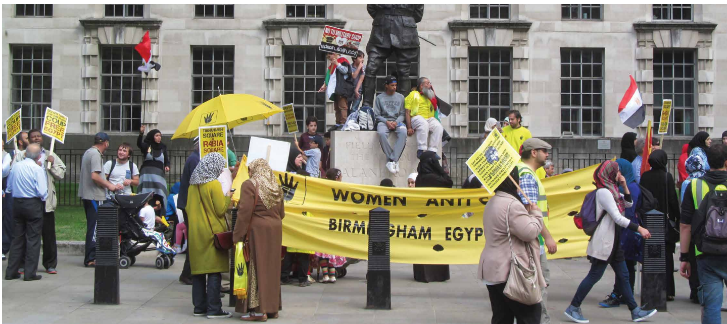
Muslim Brotherhood supporters from Birmingham in the UK