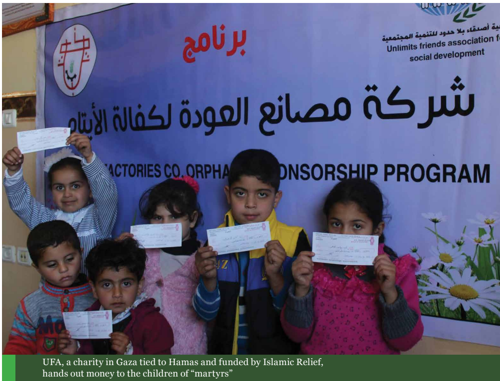
UFA, a charity in Gaza tied to Hamas and funded by Islamic Relief, hands out money to the children of "martyrs"

UFA openly advertises projects funded by U.S. charities in prominent Hamas literature. 226 And the UFA website boasts a certificate of support from Ummah University, an institution in Gaza directly controlled by Hamas's interior ministry. 227