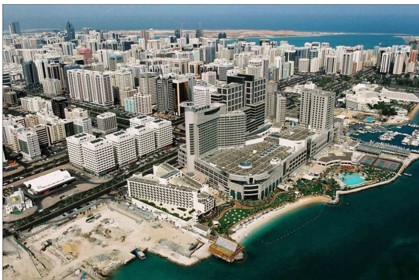
The United Arab Emirates’ capital, Abu Dhabi, on the Persian Gulf. Since its creation, the emirates have had to grapple with formidable security challenges from their Arab and Iranian neighbors and have been overburdened with territorial disputes.

Reality, however, is quite different. Relations between Saudi Arabia and the United Arab Emirates (UAE), the GCC’s two leading states with a modicum of military muscle, have been anything but amicable despite their close economic ties, with both leaderships finding it difficult to transcend their egos, biases, and personal politics in favor of the national interest. 1 At best, they have managed to hide their hostility and rivalry behind a thin veneer of hospitality and politeness, as vividly illustrated during their 2017 collaboration against Qatar. While Riyadh’s animosity toward Doha revolved around the latter’s support for the Muslim Brotherhood and Hamas and strong relations with Erdoğan’s Turkey, Abu