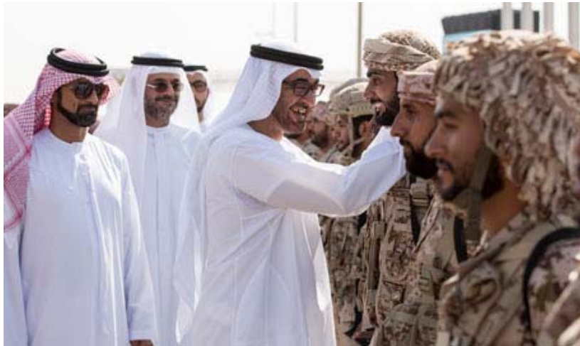
Muhammad bin Zayed (center), deputy supreme commander of the UAE armed forces, initiated an ambitious armament and military training program. In a few years, the UAE became a rising military power in the Middle East, enabling it to chart a foreign policy independent of Saudi Arabia.

Saudis perceived other GCC members as satellites in their sphere of influence, but their overbearing demeanor drew resentment from most GCC members. When Khalifa bin Zayed al-Nahyan took office in November 2004, he immediately challenged Saudi hegemony by acquiring a strong military and developing a forward-looking economy and dynamic foreign policy. This might explain why, for example, Riyadh frequently punishes UAE resistance to its condescending and domineering tendencies by causing excessive traffic jams at the Ghuwaifat border crossing for trucks bound for Saudi Arabia. It is not unusual for trucks transporting Emirati goods to line up for fifteen miles awaiting the completion of bureaucratic formalities. 9 Doha's tenacious and persistent determination to pursue an independent policy line that often ran counter to Riyadh's expectations, eventually drove