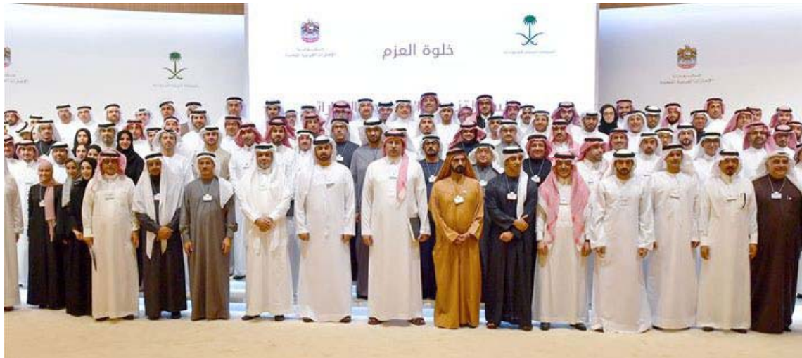
More than 150 Saudi and Emirati officials met in an inaugural retreat in February 2017 to strengthen bilateral relations following establishment of a joint coordination council.

The UAE's deep concerns about the rise of Islamism had to do with the religious proclivity of the Emirates' armed forces. Religion is important for the UAE's indigenous population, and the Muslim Brotherhood, the only organized religious movement in the country, enjoys the support and respect of a considerable segment of Emiratis. If the UAE authorized general elections open to Brotherhood participation, the organization would have no difficulty winning 100 percent of parliamentary seats. 18