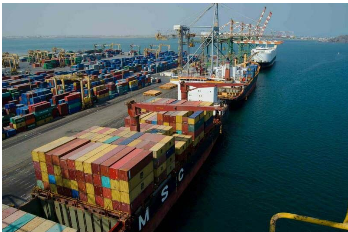
The port of Aden, on Yemen's southern coast, is a major hub for cargo and regional transportation. The UAE wants to administer the strategic port and to ensure that it becomes an extension of Dubai and not of a competitor.

however, that the visit would draw together “the two countries’ views on current developments in the region.” 23 The need to bring their views closer despite “exceptional” relations suggests serious divisions. These were confirmed when more than 150 Saudi and Emirati officials met in an inaugural retreat in February 2017 to strengthen bilateral relations following the establishment of a joint coordination council. According to the UAE, “The meeting was held to discuss fields of mutual interest and place general framework and plans for the council built to reflect bilateral cooperation between both countries and develop a new system of cooperation.” 24 The UAE, like other GCC member states, resents Saudi tutelage and big brother self-image. 25