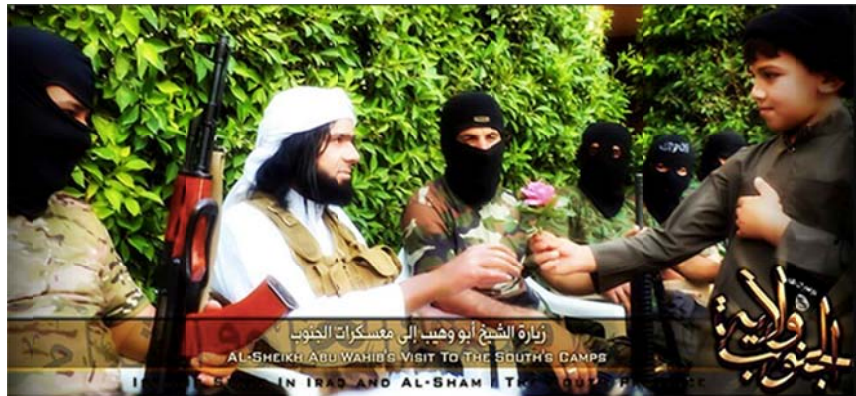
Screenshot of ISIS Twitter account. Twitter is by far the platform of choice for ISIS supporters, who have found ways to outmaneuver Twitter's continued closing of jihadist accounts.

The public outcry attending President Trump's attempted travel ban from seven radical Muslim states, designed to prevent foreign terrorists from entering the country, has diverted attention from the longstanding danger of homegrown jihadists. As early as 2007, the New York Police Department (NYPD) released a 92-page report documenting the extent of al-Qaeda-linked homegrown jihad in Europe and the United States. 1 The Obama administration, however, went out of its way to ignore, deny, and whitewash any homegrown terror that smacked of Islamist violence. But a decade later, al-Qaeda has been all but eclipsed by the Islamic State (ISIS), which has skillfully used social media to become the foremost purveyor of jihadist indoctrination in the West, creating a "virtual caliphate," extremely dangerous and easily accessible to vulnerable men and women from a variety of backgrounds in a manner al-Qaeda was never able to achieve. Even were all territory now under ISIS control to be retaken, this virtual caliphate could continue to pose a major threat.