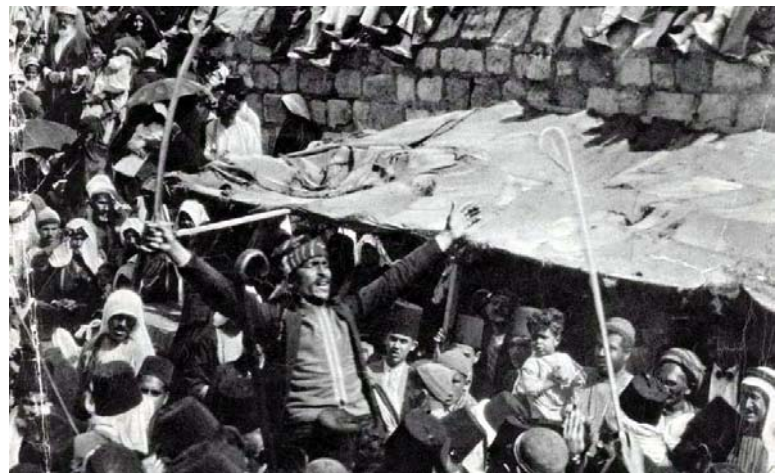
Pan-Arab nationalists carried out a pogrom in Jerusalem in 1920, killing five Jews and wounding 211. In 1921, Arab riots claimed 90 dead with hundreds wounded. In 1929, more violence resulted in the death of 133 Jews and the wounding of hundreds more.

For me, you may be a fact, but for [the Arab masses], you are not a fact at all—you are a temporary phenomenon. Centuries ago, the Crusaders established themselves in our