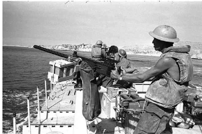
Nasser announced the closure of the Strait of Tiran to Israeli and Israel-bound shipping. Within days of the start of the war, Israeli gunboats passed freely through the straits.

The die was cast. Having maneuvered himself yet again into the driver's seat of inter-Arab politics, Nasser could not climb down without risking a tremendous loss of face. He was approaching the brink with open eyes, and if there was no way out of the crisis other than war, so be it: Egypt was prepared. Daily consultations between the political and the military leaderships were held. The Egyptian forces in Sinai were assigned their