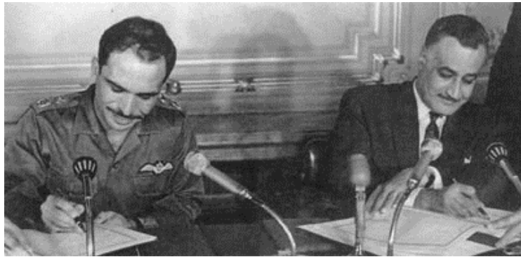
Nasser's former Arab rivals were standing in line to rally behind Egypt. On May 30, Jordan's King Hussein (left) arrived in Cairo where he immediately signed a defense pact with Egypt.

PLO and hitherto one of the king's archenemies. The following day, an Egyptian general arrived in Amman to command the eastern front in the event of war. On June 4, Iraq followed suit by entering into a defense agreement with Egypt, and Nasser informed King Hussein that their pact now included Iraq as well. By this time, Arab expeditionary forces—including an Iraqi armored division, a Saudi and a Syrian brigade, and two Egyptian commando battalions—were making their way to Jordan. 20 The balance of forces, so it seemed to the Arabs, had irreversibly shifted in their favor. The moment of reckoning with the “Zionist entity,” as they pejoratively called Israel, had come. “Have your authorities considered all the factors involved and the consequences of the withdrawal of UNEF?” the commander of the U.N. force, Gen. Indarjit Rikhye, asked the Egyptian officers bearing the official demand. “Oh yes sir! We have arrived at this decision after much deliberation, and we are prepared for anything. If there is war, we shall next meet at Tel Aviv.” The Iraqi president Abdel Rahman Aref was no less forthright. “This is the day of the battle,” he told the Iraqi forces leaving for Jordan. “We are determined and united to achieve our clear aim—to remove Israel from the map. We shall, Allah willing, meet in Tel Aviv and Haifa.” 21