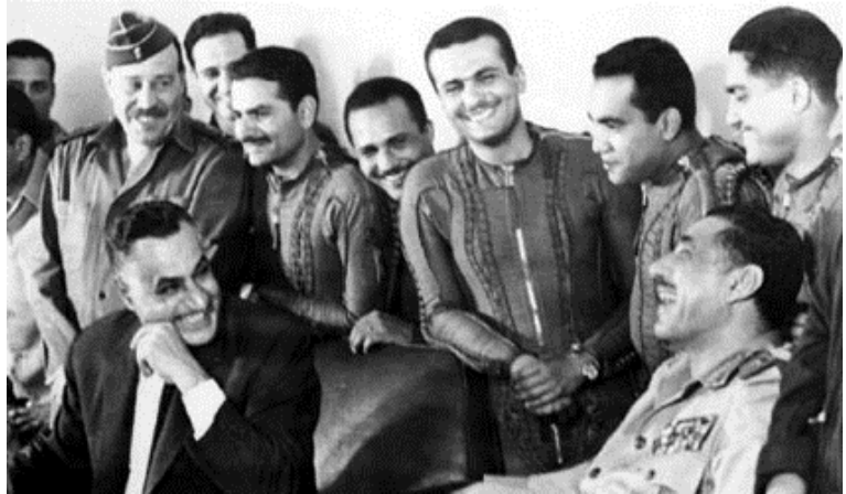
May 22, 1967, Nasser (left, 1 st row) joins Egyptian air force pilots at Bir Gifgafa base before the Six-Day War. The total Arab rejection of Jewish statehood made an all-out Arab-Israeli war a foregone conclusion.

This view could not be further from the truth. If wars are much like road accidents, as the British historian A.J.P. Taylor famously quipped, having a general cause and particular causes at the same time, then the June 1967 war was anything but accidental. Its specific timing resulted of course from the convergence of a number of particular causes at a particular juncture. But its general cause—the total