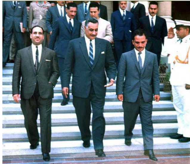
(Left to right) Abdel Salam Aref of Iraq, Gamal Abdel Nasser of Egypt, and King Hussein of Jordan arrive in Alexandria for an Arab summit, October 1964.

The Egyptian president had nothing but contempt for most members of the “Arab Nation” he sought to unify: “Iraqis are savage, the Lebanese venal and morally degenerate, the Saudis dirty, the Yemenis hopelessly backward and stupid, and the Syrians irresponsible, unreliable and treacherous,” he told one of his confidants. 7 Neither did he have a genuine interest in the Palestinian problem—pan-Arabism’s most celebrated cause: “The Palestinians are useful to the Arab states as they are,” he told a Western journalist in 1956. “We will always see that they do not become too powerful. Can you imagine yet another nation on the shores of the eastern Mediterranean!” 8 Yet having recognized the immense value of this cause for his grandiose ambitions, he