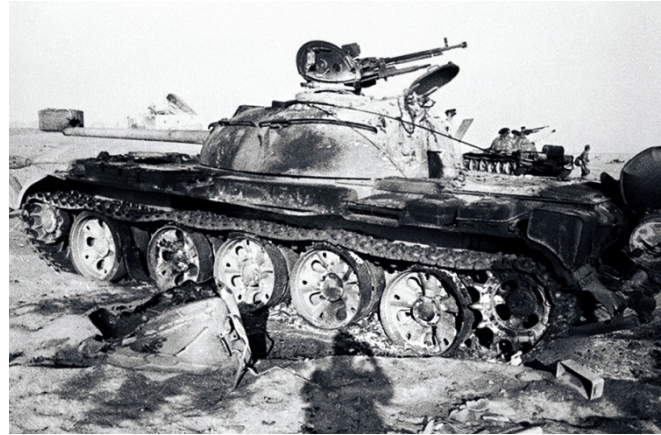
Egyptian tank, Sinai Peninsula, 1967. On May 14, Egypt moved two armored divisions into the Sinai Peninsula, formally demilitarized since the 1956 Suez war. Three days after the start of the war, their army was crushed and expelled from Sinai.

These events made Nasser yet again the undisputed leader of the Arab world, the only person capable of making the Arabs transcend, however temporarily, their self-serving interests for the sake of the collective good. He was nowhere near his cherished goal of promoting the actual unification of the Arab world under his leadership as he had seemingly been in 1958 when Syria agreed to merge with Egypt. Yet he had successfully hijacked pan-Arabism’s most celebrated cause and established a working relationship with his erstwhile enemies in Amman and Riyadh. In a second summit meeting in Alexandria in October 1964, the heads of the Arab states accepted Nasser’s long-term, anti-Israel strategy. This envisaged the laying of the groundwork for the decisive confrontation through the patient buildup of Arab might in all areas—military, economic, social, and political—and the simultaneous weakening of Israel through concrete actions such as the diversion of the Jordan River estuaries. The PLO was authorized to create an army of Palestinian volunteers, to which the