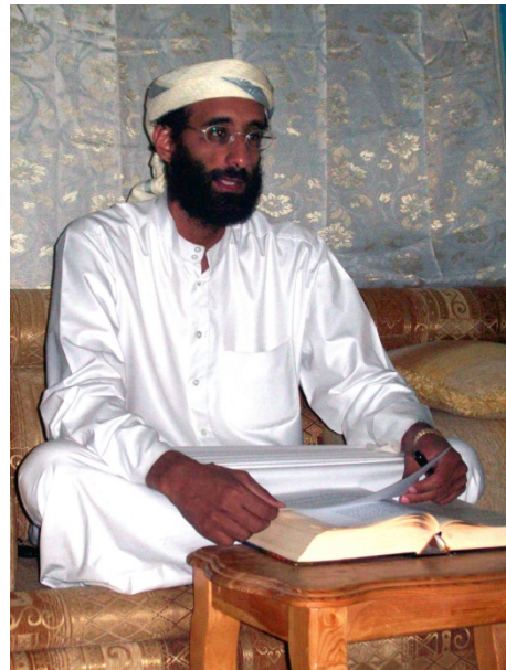
U.S. bureaucrats are unsurprisingly incompetent at vetting possible Islamists. In 2001, the Pentagon invited Anwar al-Awlaki, the American Islamist, to lunch. In September 2011, he became the first United States citizen to be targeted and killed by a U.S. drone strike.

not tell about a Muslim's political outlook. To make matters more confusing, Islamists often dissimulate and pretend to be moderates while some believers change their views over time.