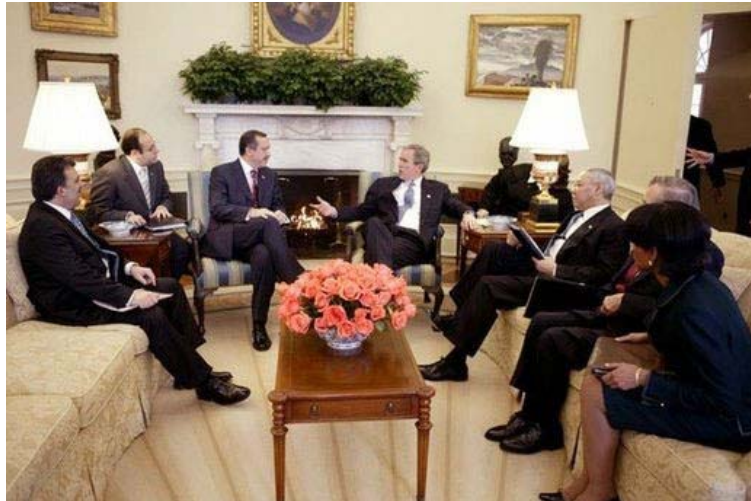
In the early years of Erdoğan's government, the West offered him unconditional support, mistakenly thinking that this supposed Muslim reformist would strengthen democracy in Turkey. Here, Erdoğan (3 rd from left) meets with U.S. president George W. Bush and members of the administration at the White House, January 28, 2004.

Religion was why Erdoğan and Gülen had long been allied against the "infidel" Kemalists, leftists, and seculars. Religion was also why Erdoğan's and Gülen's Sunni Islamist followers are now at each other's throat. Erdoğan and Gülen did not break up