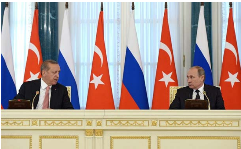
Following the coup attempt, Erdoğan’s government has reached out to the Russians and moved farther from an alliance with Europe. Here Erdoğan joins Russian president Vladimir Putin (right) for a news conference, August 9, 2016, following their meeting in St. Petersburg.