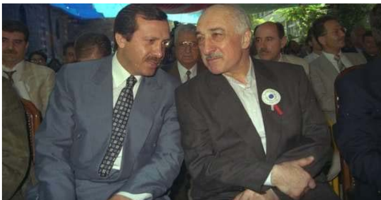
After coming to power in parliamentary elections in November 2002, Erdoğan (left) quickly allied with Fetullah Gülen (right), a Muslim preacher with a powerful network of followers. But the two leaders have since fallen out, and following the attempted coup, Erdoğan accused his former ally of masterminding the uprising.

The perpetrators of the July 15 coup attempt are widely believed to be a coalition of officers: members of the "Gülen" group, who had infiltrated military ranks and successfully hidden their ideological leanings, often by drinking alcohol publicly and showcasing wives without Islamic headscarves; Kemalists loyal to the republican tradition of modern Turkey's founding father, Mustafa Kemal Atatürk, and opportunists. Fetullah Gülen, a Muslim preacher, self-exiled in Pennsylvania since 1999 and once Erdoğan's staunchest political ally, has emerged as the prime suspect. 14