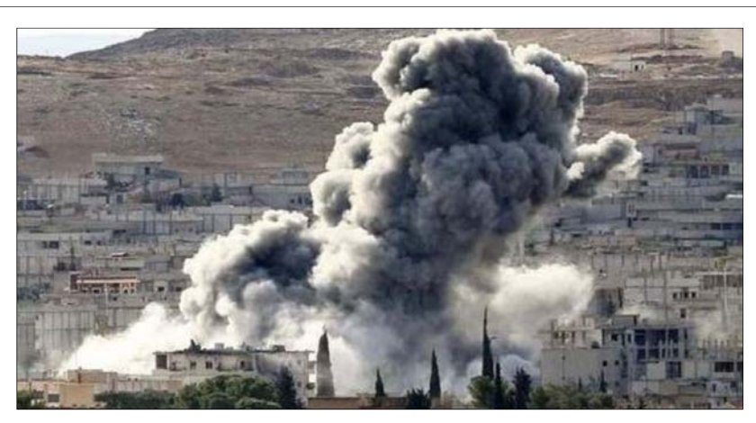
An air campaign by Western powers will only contain ISIS, not destroy it, because the group's strategic centers of gravity may be largely invulnerable to air attack. Air strikes also increase the likelihood of civilian deaths.

The ground war will need to be slow and methodical. Western forces should not expect a "race to Baghdad," an air-to-ground