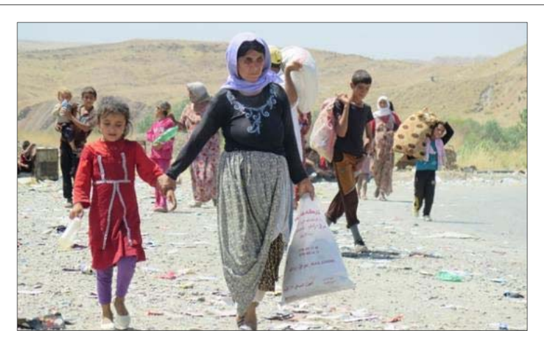
Executing prisoners by beheading and sexual assaults on women are common Islamic State tactics. In Iraq, Yezidi women and girls, many aged 14 and younger, have been forcibly married, sold, or given to Islamic State fighters and supporters. ISIS behavior upends the "laws of war" agreed upon by most nations beginning in the 19th century.