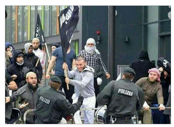
ISIS supporters attack police in Germany. Western societies must take seriously an ideology whose adherents embrace mass murder, genocide, and slavery because they believe those practices have been ordained by God. This enemy is not going to just go away even if Washington or the West eventually destroys the Islamic State.

depths of human malevolence and the power of malignant idealism and organized hate. Western societies must take seriously an ideology whose adherents embrace mass murder, genocide, and slavery because they believe those practices have been ordained by God. The West also needs to understand individuals and whole societies where religious fanaticism is central to their psychology. Above all, the West needs to understand that the jihadists and their ideology are not at the lunatic fringe of Islam but are instead the fanatic core of Islam deep and enduring roots the faith's history and thinking, especially in the Wahhabi interpretation of Islam.<sup>46</sup> The bottom line is that this enemy is