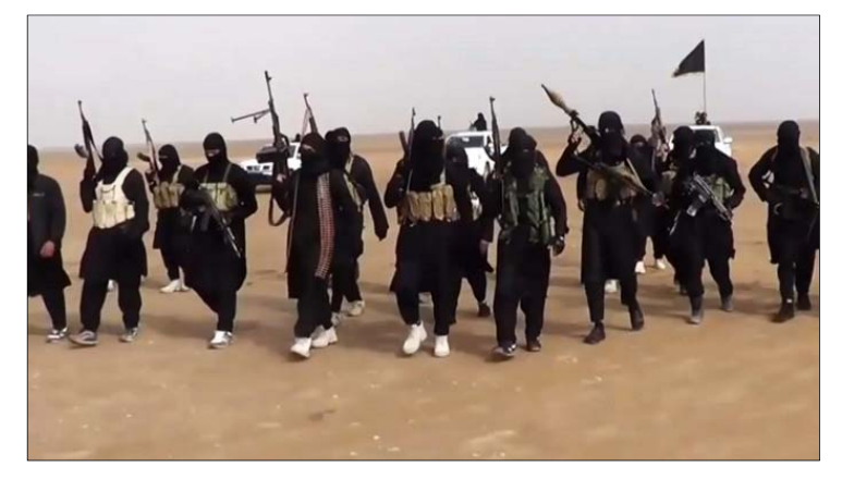
Soldiers of the self-proclaimed caliphate of the Islamic State (ISIS) mobilize in Raqqa province. ISIS shows no sign of collapsing. It has built a reasonably effective military, established a minimally functional governing regime in the areas it controls, and ruthlessly suppressed or co-opted any potential opposition. Current trends could result in the consolidation of a de facto ISIS statelet.

The weakness of Iraqi and Syrian security forces. Even before ISIS's conquest of Ramadi 2014-early (late 2015) and Palmyra (May 2015), some 30,000 anti-ISIS troops and Shiite militia took a month's time and heavy casualties to retake the notvery-heavily defended town of Tikrit while the late 2015 Ramadi offensive took several months to recapture a largely deserted city