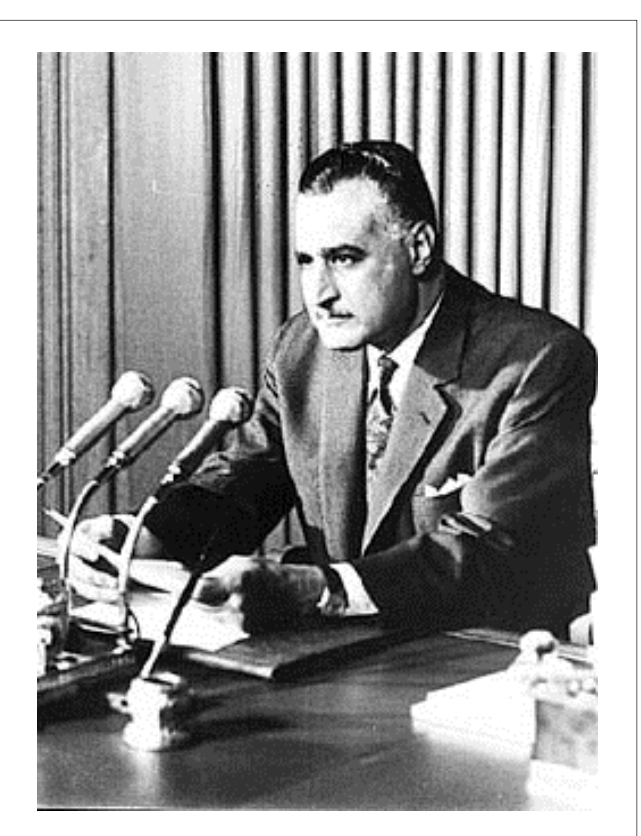
Modern rulers have found the language of fatalism useful, and they frequently employ it. In the aftermath of the terrible defeat of the Egyptian army in June 1967, President Gamal Abdel Nasser resorted to an Arabic proverb: "Precaution does not change the course of fate."

Modern rulers have found the language of fatalism no less useful, and they frequently invoke it. Gamal Abdel Nasser of Egypt regularly dismissed unpleasant developments as inescapable destiny even as he associated his