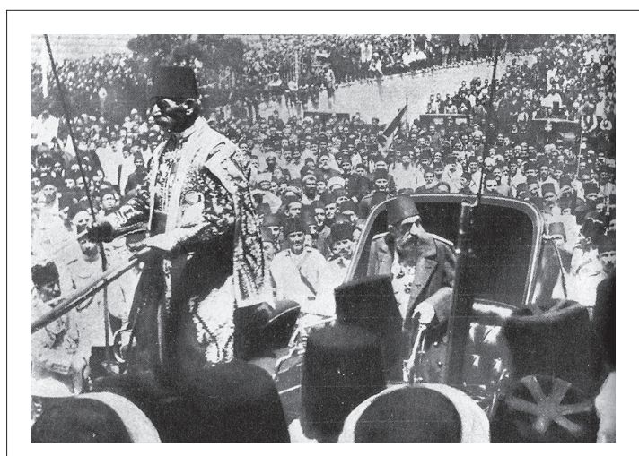
An assassination attempt against Sultan Abdul Hamid by Armenian nationalists in 1905 was but one episode in a cycle of Armenian vs. Ottoman violence that convulsed Turkey early in the twentieth century.

people perished and thousands more fled to Europe and the United States.