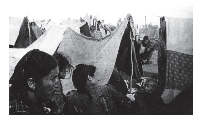
The ethnic cleansing of Turkish Armenia was accomplished in a variety of ways including deportations and outright massacres. Here, Armenian deportees struggle to survive in makeshift tents erected in the Syrian desert to which they were deported in 1915.

Bowing to international pressure, in February 1914, the Ottoman authorities accepted a Russo-German proposal for the creation of two large Armenian provinces, to be administered by European inspectors-general appointed by the great powers. This was a far cry from the Armenians' aspirations for a unified independent state as its envisaged territory was partitioned into two separate entities rather than creating a cohesive whole, yet it was the most significant concession they had managed to extract from their suzerain, and most of them were anxious to preserve this gain come what may. Hence, when the Ottoman Empire entered World War I on the side of the German-Austro-Hungarian Triple Alliance, the Armenians immediately strove to demonstrate their loyalty: Prayers for an Ottoman victory were said in churches throughout the empire, and the Armenian patriarch of Istanbul, as well as several nationalist groups, announced their loyalty to the Ottoman Empire and implored the Armenian masses to perform their obligations to the best of their ability.