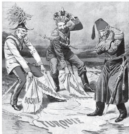
The Ottoman Turks eagerly accepted the Islamic supremacist view of other faith communities and looked on in horror as their empire was dismembered by despised dhimmis beginning in the 19th century. Here, Bulgarian king Ferdinand (center) and Austrian emperor Franz Joseph (left) tear apart the map while Ottoman sultan Abdul Hamid glowers.

Conversion was usually voluntary although the pressures on subaltern peoples to convert were real. In the traditional phrasing, a Christian or Jew who “surrendered” to the will of Allah was “honored by the glory of Islam.” Even the land-